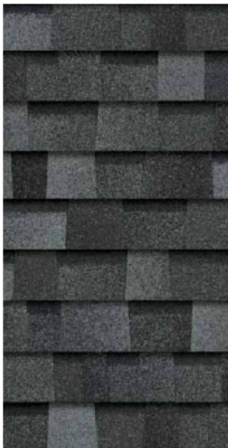
Slatestone Gray† Not available in Service Areas 4, 5, 7, 9.